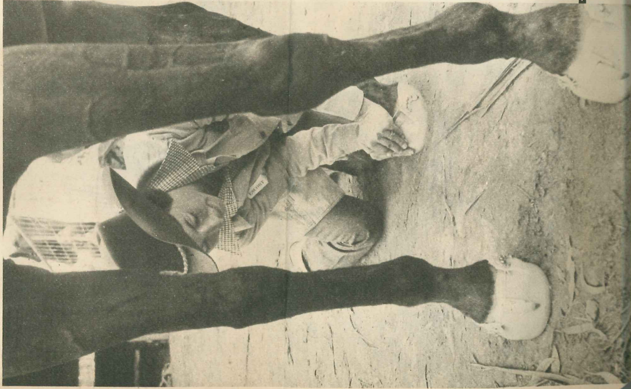
★ RIGHT: Film equipment had to be carted for 500 miles on pack horses.