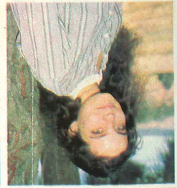
Sigrid Thornton, heroine.