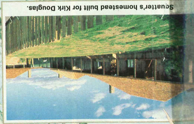
Squatter's homestead built for Kirk Douglas.